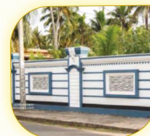
Master Compound Wall