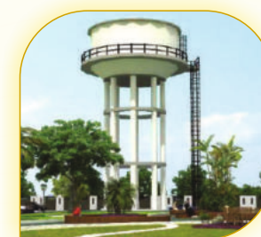
Over Head Tank