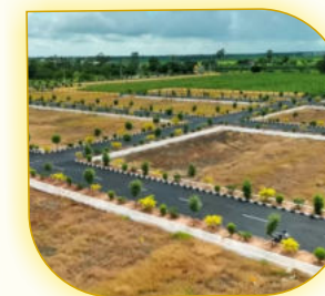
All 40" internal Roads