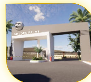
Major Entrances Arch