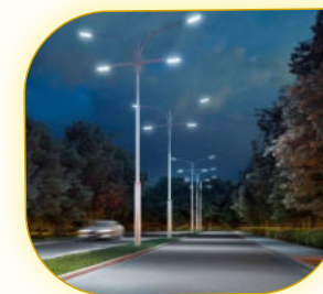
80" wide Road with Central lighting